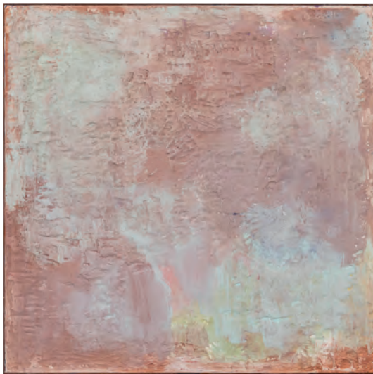
Thea Djordjadze, Untitled , 2021, wood, plaster, paint, 130 × 130 × 3.5 cm. Photo: Ingo Kniest. Courtesy Sprüth Magers. © Thea Djordjadze / VG Bild-Kunst, Bonn

Lenght: 1h15 – Price: FP 8,50 €, RP 6,50 €.